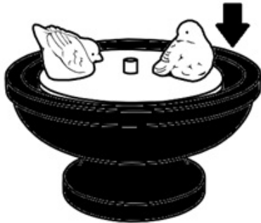
FT-328B (20 lbs) 13"W x 6.5"H

Assemble your fountain on a level surface capable of holding a minimum of 30 pounds with an approximate 1/2 square foot footprint.