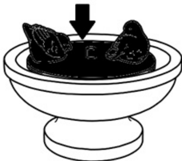
FT-328A (6 lbs) 9.5"W x 4"H